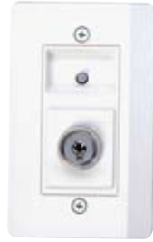
RTS451KEY UL S2522