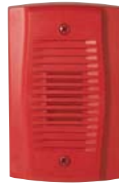
MHR UL S4011