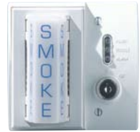
SSK451 with PS24LOW strobe and PS12/24 LENS lens