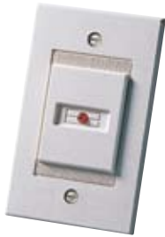
RA400Z UL S2522