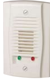
APA151 UL S4011