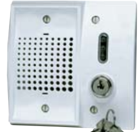
SSK451 UL S2522