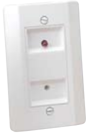
RTS451 UL S2522

System Sensor provides system flexibility with a variety of accessories, including two remote test stations and several different means of visible and audible system annunciation. As with our duct smoke detectors, all duct smoke detector accessories are UL listed.