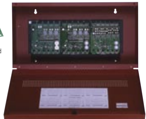
BB-6 Enclosure with CH-6 Chassis